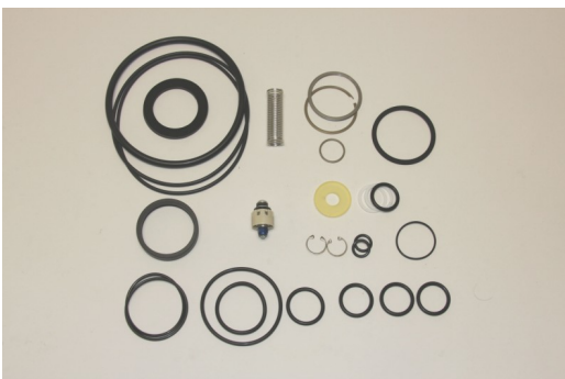
Repair kits for pumps, air and gas boosters.