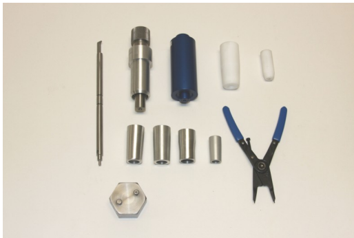
Assembly tools for SC pumps, air and gas boosters.