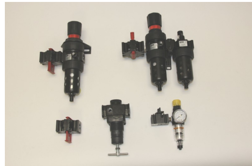
Air filters, pressure regulators, lubricators and shut-off valves on 1/4", 3/8" & 1/2" NPT.