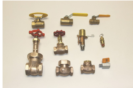
Air valves, liquid valves and air relief valves.