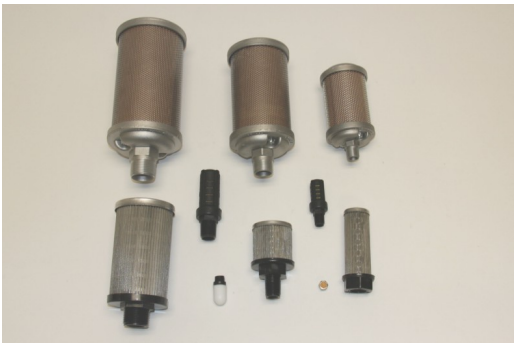
1/8" to 1" NPT mufflers, 1/4" to 1/2" NPT filters.