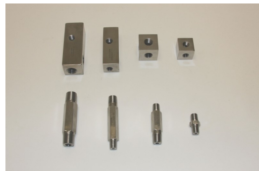
Stainless Steel manifolds & nipples.