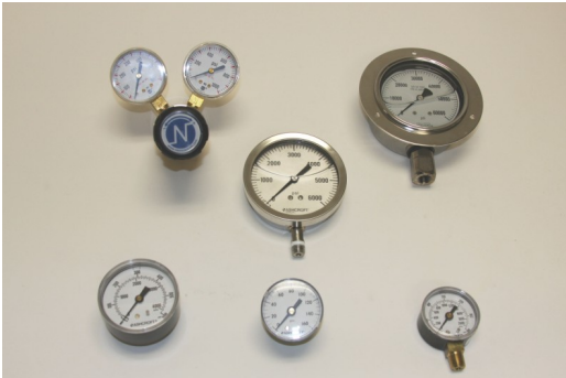
Low & high press., liquid filled & dry, female & male, NPT & 9-16-18 thd. connection gauges and gas press. regulators w/gauges.