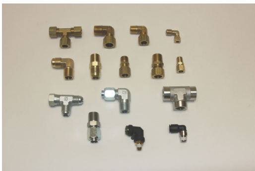
Low pressure NPT air & hyd. compression fittings, tees, elbows, reducers, etc.